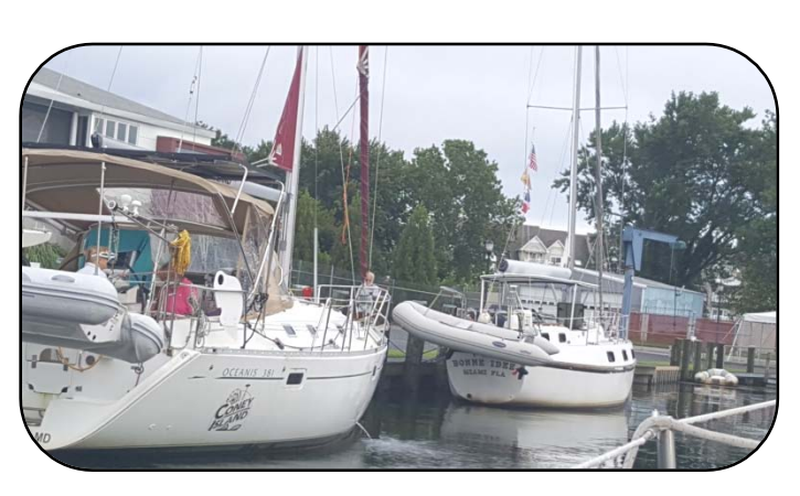
SOS Boats