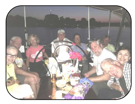
Gathering on cockpit of Sea Tango