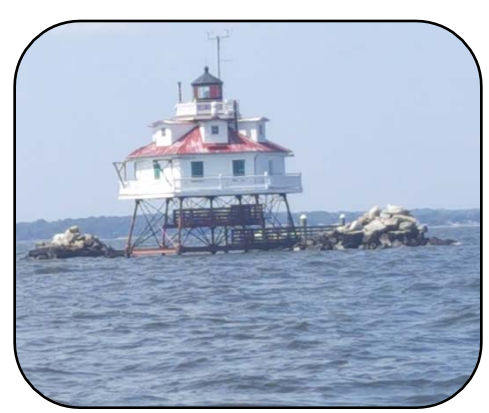
Thomas Point